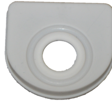
Figure { SEQ Figure \* ARABIC }. Evaporation Cover.