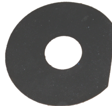
Figure { SEQ Figure \* ARABIC }. Splash Guard.