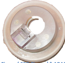
Figure { SEQ Figure \* ARABIC }. Liquid probe tip holder.