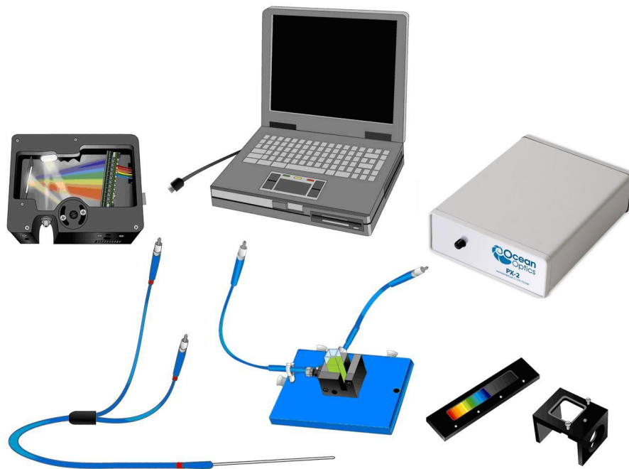
Ocean Optics USB2000+ Fiber Optic Spectrometer Typical Set-up

The USB2000+ Spectrometer connects to a computer via the USB port or serial port. When connected through a USB 2.0 or 1.1, the spectrometer draws power from the host computer, eliminating the need for an external power supply. The USB2000+, like all USB devices, can be controlled by our SpectraSuite software, a completely modular, Java-based spectroscopy software platform that operates on Windows, Macintosh and Linux operating systems.